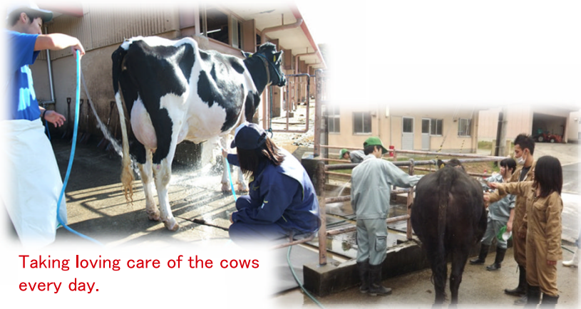
Taking loving care of the cows every day.