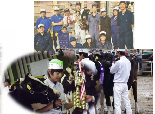
Achieving superior results at competitive exhibitions.