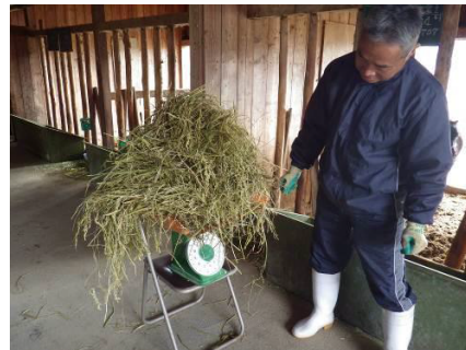
We feed our cows with rice fodder and pasture grass that we produce here on our farm.

For the mother cows' bedding we use rice husks, a by-product of paddy rice, and for the calves we use rice straw.