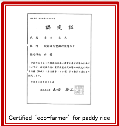
Certified 'eco-farmer' for paddy rice