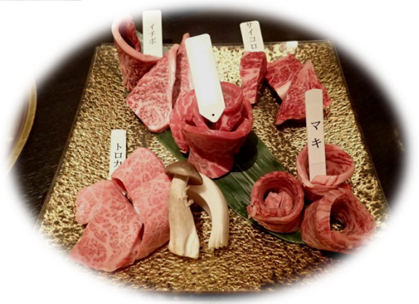
Popular among the local yakiniku restaurants!!