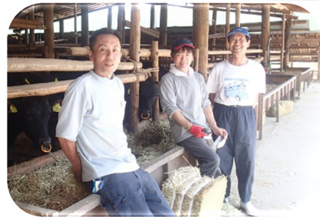
We raise our cows with the utmost care.

The feed and the water are both delicious!