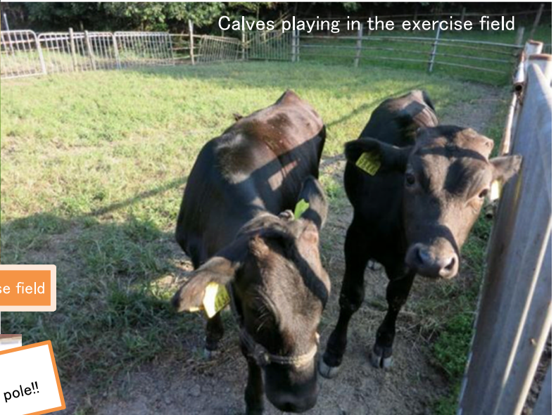
Calves playing in the exercise field

Approx. 1,000m 2 of pasture ↔ Approx. 300m 2 of exercise field