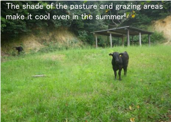
The shade of the pasture and grazing areas make it cool even in the summer!