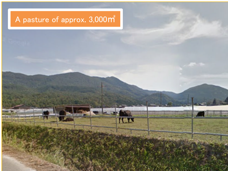
A pasture of approx. 3,000m 2

We make sure our calves get plenty of exercise out in the pasture so that they are good and strong for the shipping process.