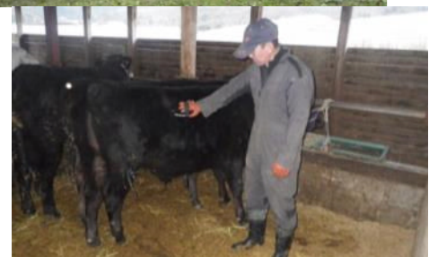
Brushing the cows clean.