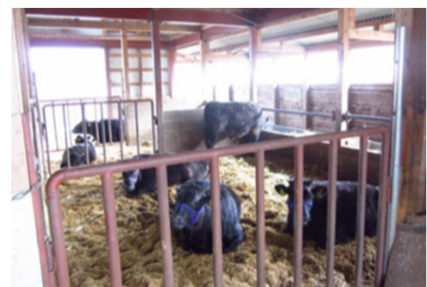
A comfortable barn filled with rice husks galore!