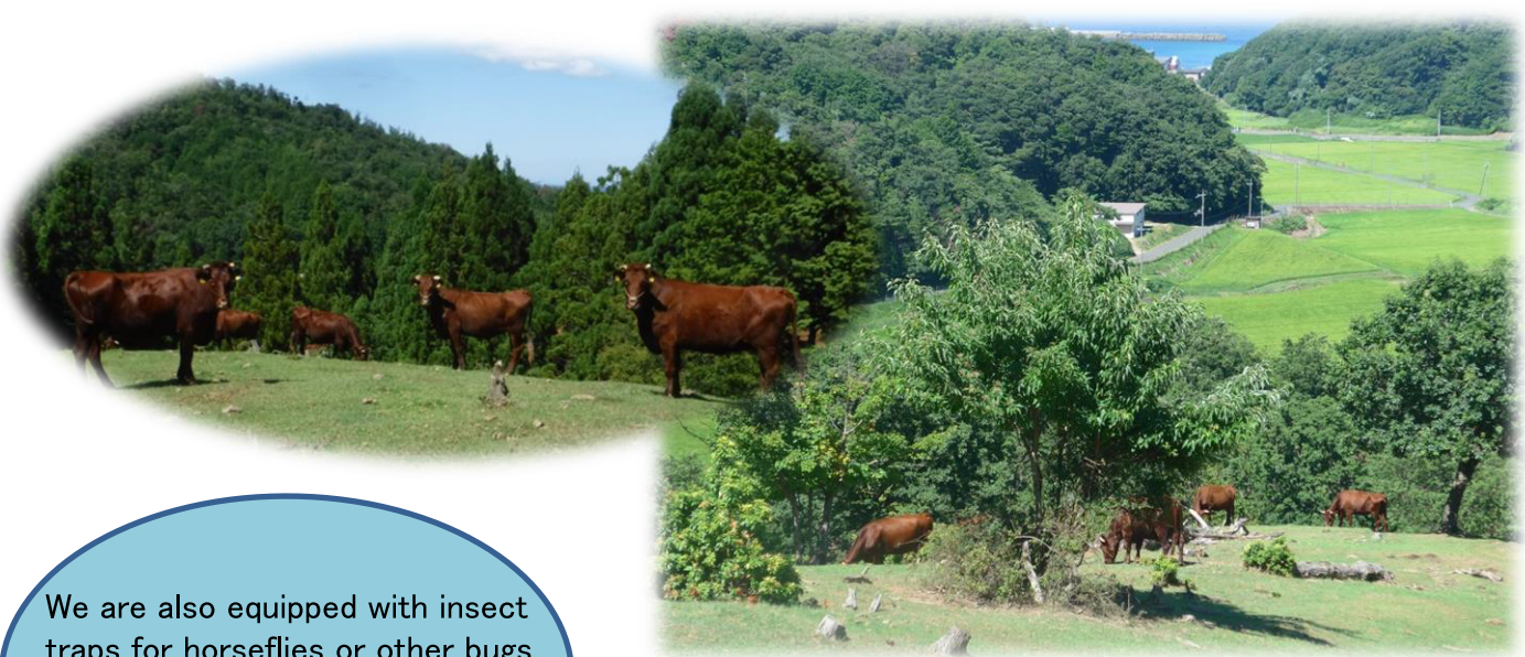
Vast pastures looking out onto the Japan Sea

We are also equipped with insect traps for horseflies or other bugs to reduce stress for the cows and to aid in sanitation.